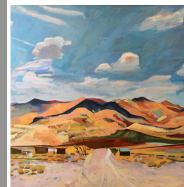
Merel van Engelen, Ghost Town, 2015